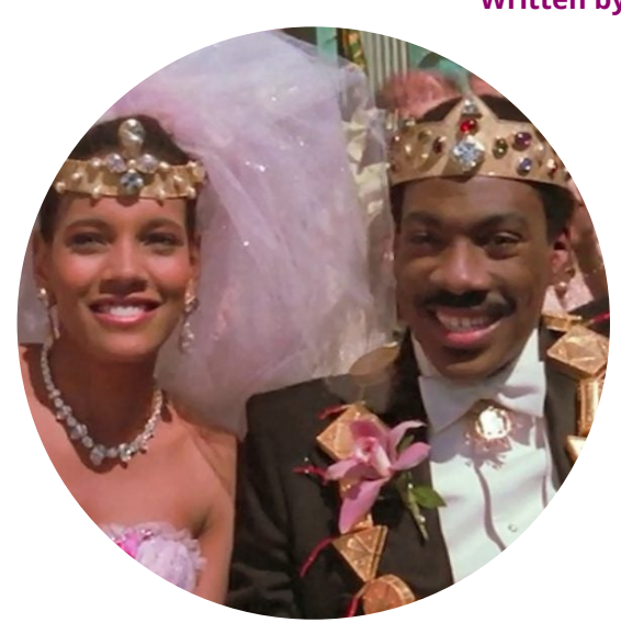
Prince Akeem with his bride at the end of part 1